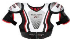
Shoulder Pads From $69

If you are interested in officiating games and timekeeping/scoring then please contact the rink on 9659 5557