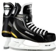
Skates From $139