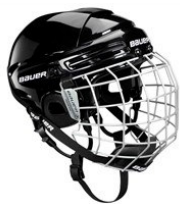
Helmets with Cage From $119