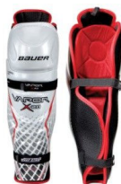
Shins From $85