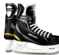
Skates From $139