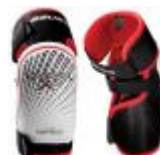
Elbow From $59