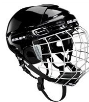
Helmets with Cage From $119