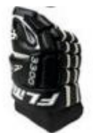
Gloves From $79