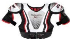
Shoulder From $79